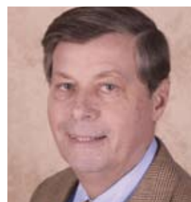
Thomas E. Dewey